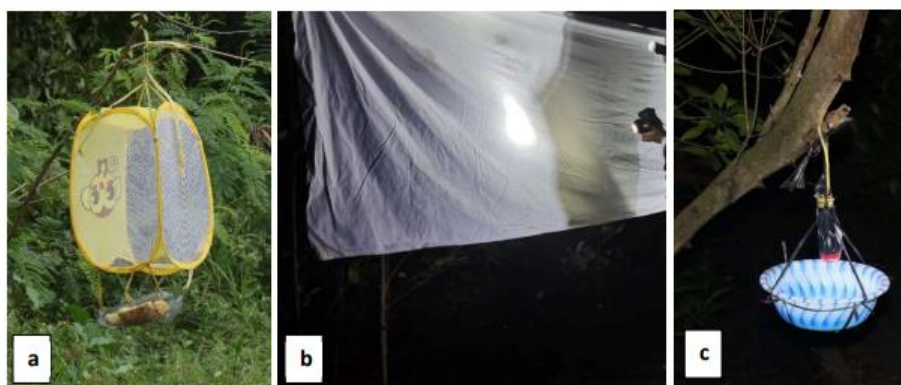
Gambar 3. Baited trap (a). Light trap layer (b) dan light trap killing agent (c)