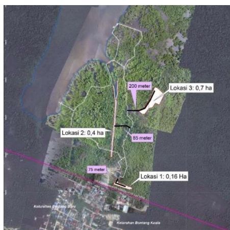
Figure 1. Map of biodiversity monitoring locations in Bontang Mangrove Park

Biodiversity monitoring and evaluation activities in Bontang Mangrove Park, Kutai National Park were carried out from July 12, 2022 to July 19, 2022. The stages carried out are from preparation, field monitoring, laboratory analysis, to report preparation. Field data collection for monitoring and evaluation of biodiversity in the mangrove area of Kutai National Park was carried out on an area of 1.26 Ha. The area is divided into three locations, namely location one with an area of 0.16 Ha, location two which is land around the water flow covering an area of 0.4 Ha, and location three 0.7 Ha. These areas are adjacent and have the same ecosystem characteristics. Map of data collection locations in the mangrove area of Kutai National Park can be seen in figure 1.