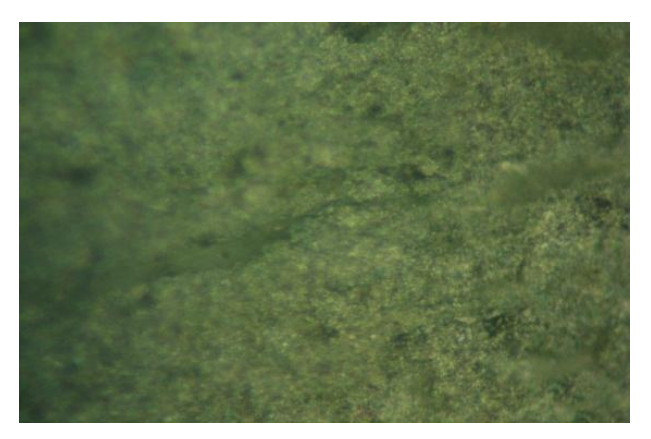
Figure 4: Alloy + Mo X 400

Figure (3-4) show photomicrographs of eutectic alloy. It is observed that the addition of Co and Mo to eutectic alloy significantly refine coarse \alpha -aluminum dendrites to fine equiaxed \alpha -aluminum dendrites. Modification refines the eutectic silicon crystals and changes the morphology of these crystals. The change in microstructure from coarse columnar grain structure to fine equiaxed grain structure and coarse dendritic structure to fine dendritic structure in alloys and with change in plate like eutectic Si to fine particles resulted in high mechanical properties of Al–Si alloys.