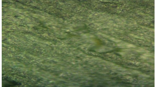
Figure 3: alloy + Co X 400