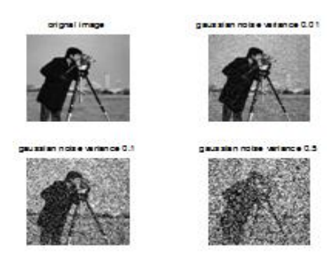
Figure 1. Images with Noise

The selected input image is subjected to Gaussian noise. The noise level consists of either 0.01,0.1 or 0.5. The noisy image of any one of the above level is generated.