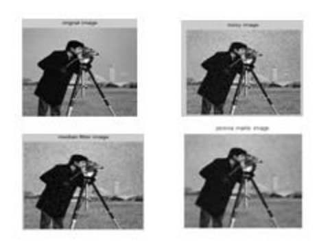
Figure 2. Images for Different Filter