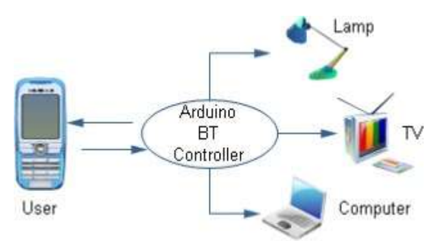
Figure 1. Home automation system block diagram by R. Piyare

Hasan [9] has developed a telephone and PIC remote controlled device for controlling the devices.pin check algorithm was used to implement the system where it was with cable network but not wireless communication.