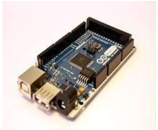
figure 3 Arduino micro-controller

We are using Arduino microcontroller board based on the ATmega2560.Sensors are attached to it and updating will be done on web server. We have chosen C++ platform for development. The coding will be done in C++.It can perform specific functions.