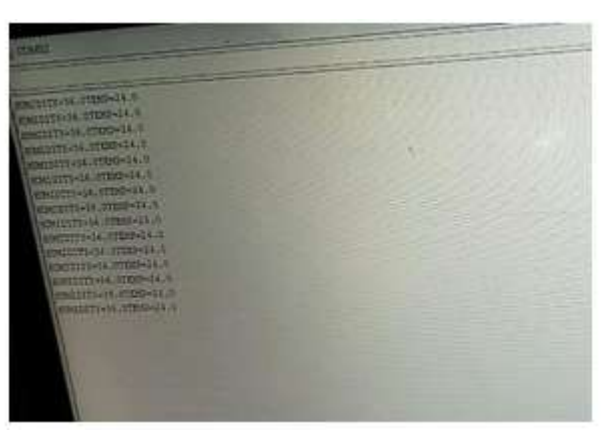
Fig 5 Displaying current temperature and humidity