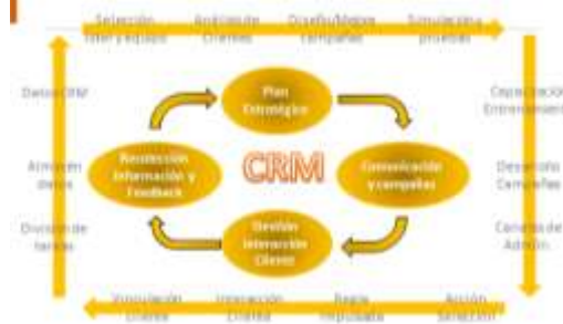
Figure 2. CRM structure